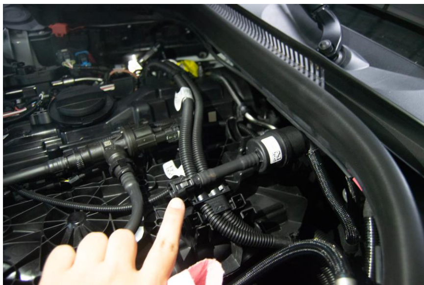
Flex Fuel Sensor installed using our custom fittings